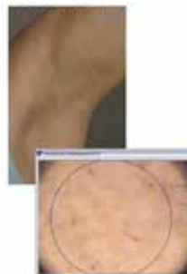
4 weeks after 4th Treatment