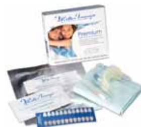
Pre-filled Tray Kit

Simple, safe (FDA & EU approved), easy to use and with minimal staff involvement this system is a great addition to the salon. Cosmetic Bright provides professional results at an affordable price.